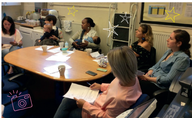
Raring to go...

We had our first meeting a couple of weeks ago, and we're pleased to say it was a busy one! Thank you to all who attended. If you were unable to come we have attached the minutes. We always try to post news on Twitter and on the school Facebook page, so you can always keep updated.